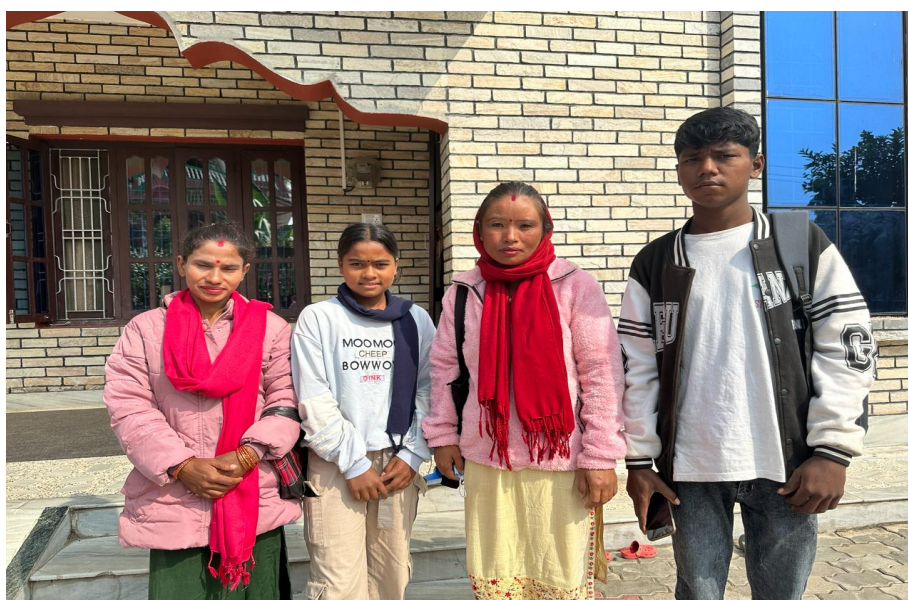
Reintegration of one of the daughters after finishing the safe home training

In addition to educational support, ASSN also focused on the survivors' psychosocial and emotional well-being. Survivors often face significant trauma and may require ongoing counseling and therapy. Therefore, ASSN provided comprehensive mental health support, ensuring access to professional counseling services, trauma-informed care, and support groups. This assistance aided in their healing process and promoted resilience as they navigated their post-trafficking journey. Furthermore, ASSN actively collaborated with governmental agencies, community leaders, and local organizations to create a supportive environment for survivors. By raising awareness, challenging stigmas, and fostering community acceptance, ASSN created a safe and inclusive space where survivors could rebuild their lives without fear of discrimination or re-victimization. Successful reintegration is a collaborative effort involving survivors, their families, communities, and various stakeholders. ASSN plans to facilitate community reintegration by continuing to organize sensitization programs, engaging in advocacy campaigns, and promoting social inclusion. By fostering understanding, acceptance, and empathy, ASSN aims to create a society where survivors can lead dignified and fulfilling lives.