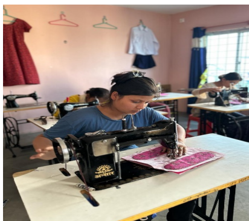
Girls at Safe home learning Sewing Cutting Training