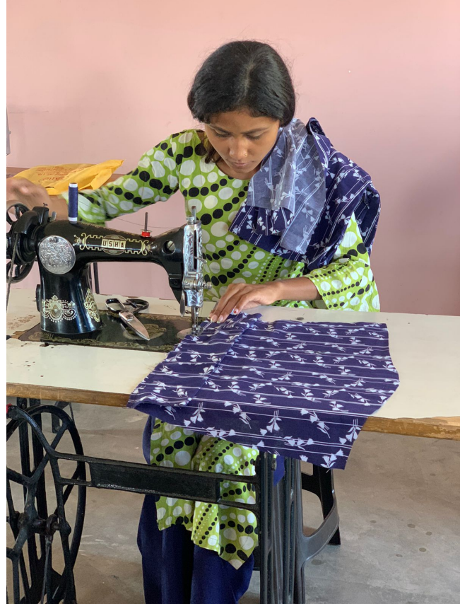
Girls at Safe home learning Sewing Cutting Training