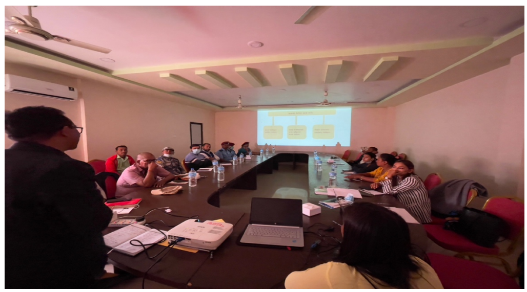
Some photos from the Coordination meetings from the year 2022