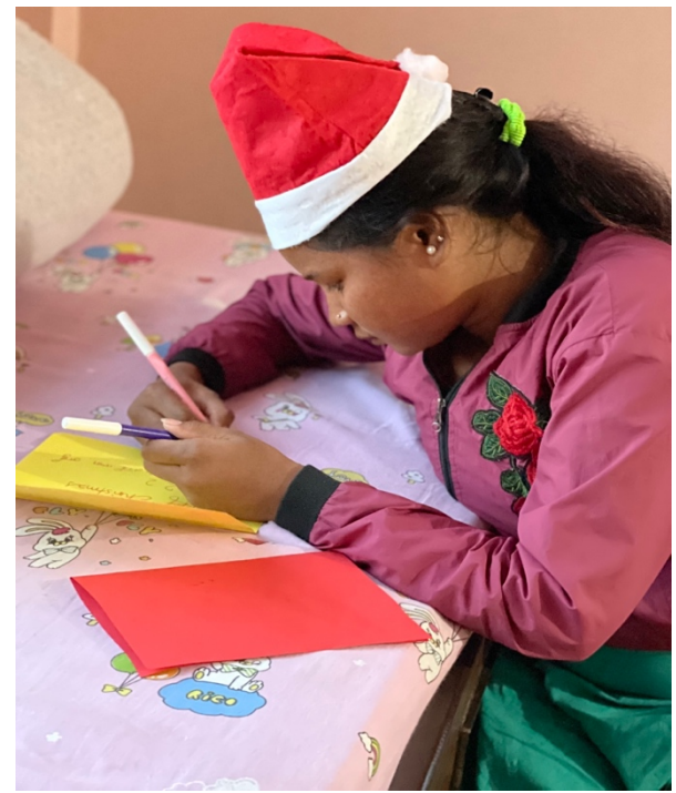
Girls at safe home participating in the SLDT classes