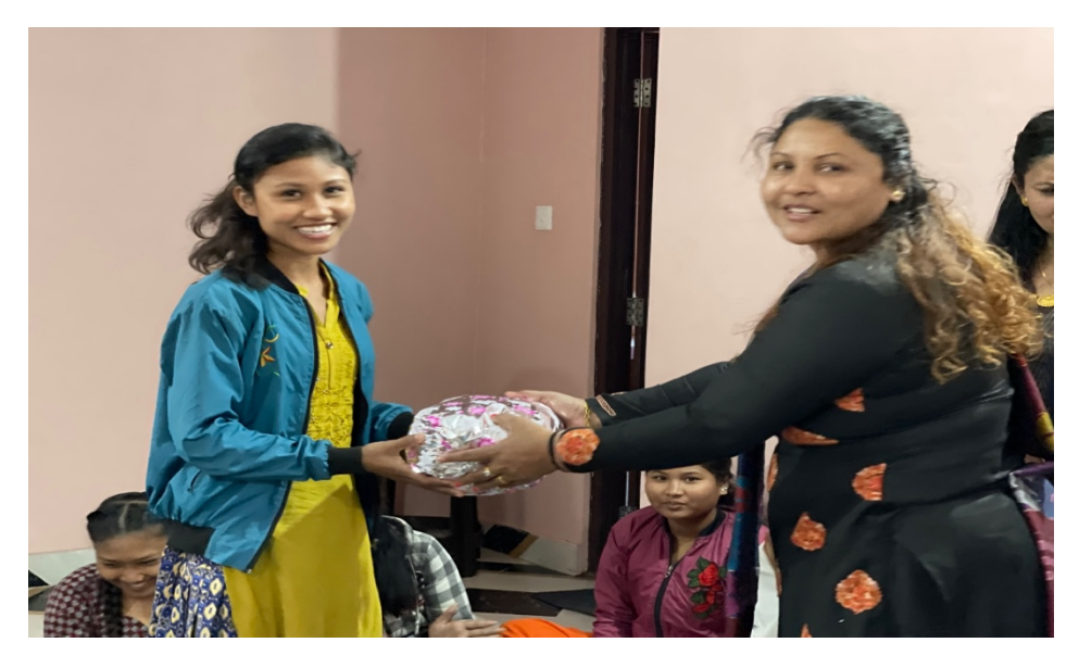
One of our daughters receiving Christmas gifts