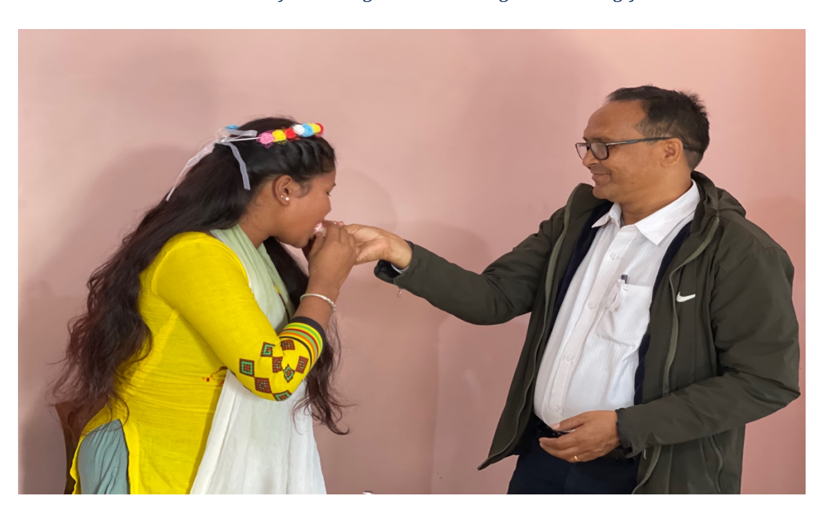
Birthday Celebration of One of our daughters