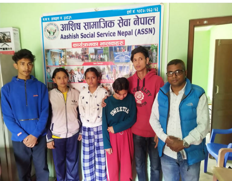
Some pictures from the Emergency Shelter Homes