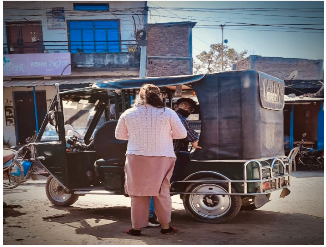
Some photos during the Border Surveillance